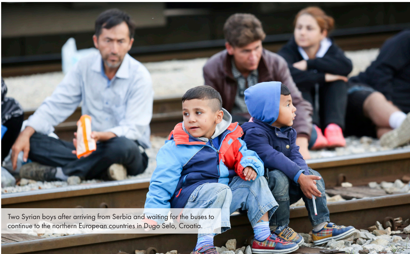
Two Syrian boys after arriving from Serbia and waiting for the buses to continue to the northern European countries in Dugo Selo, Croatia.