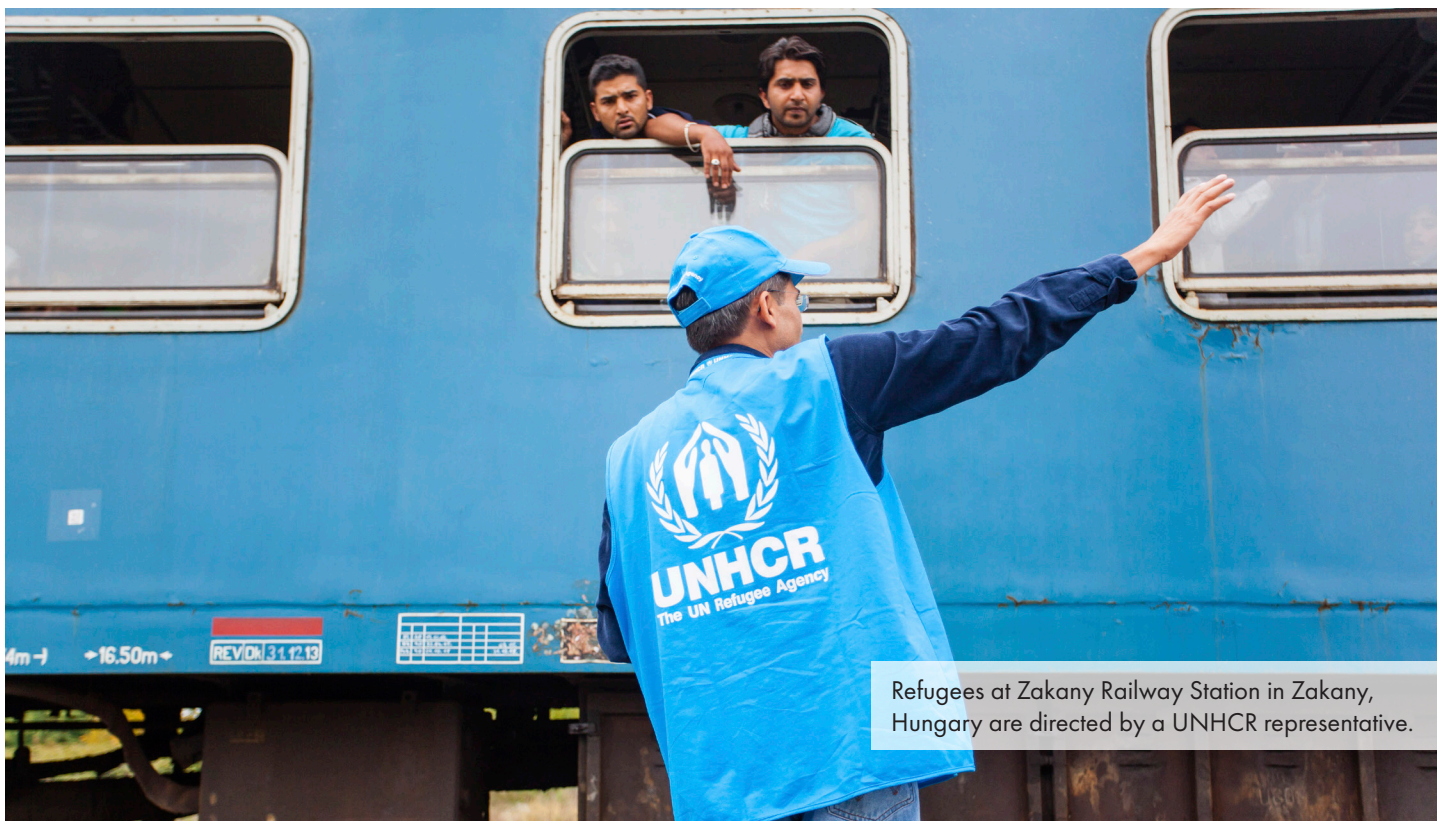
Refugees at Zakany Railway Station in Zakany, Hungary are directed by a UNHCR representative.