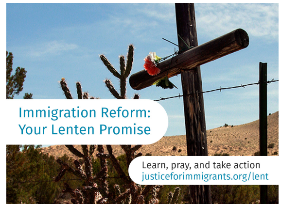
Example Facebook Timeline Image

For ideas on how to use social media resources and to stay up to date on immigration news, connect with JFI online.