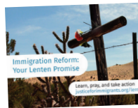
Example Facebook Timeline Image

For ideas on how to use social media resources and to stay up to date on immigration news, connect with JFI online.